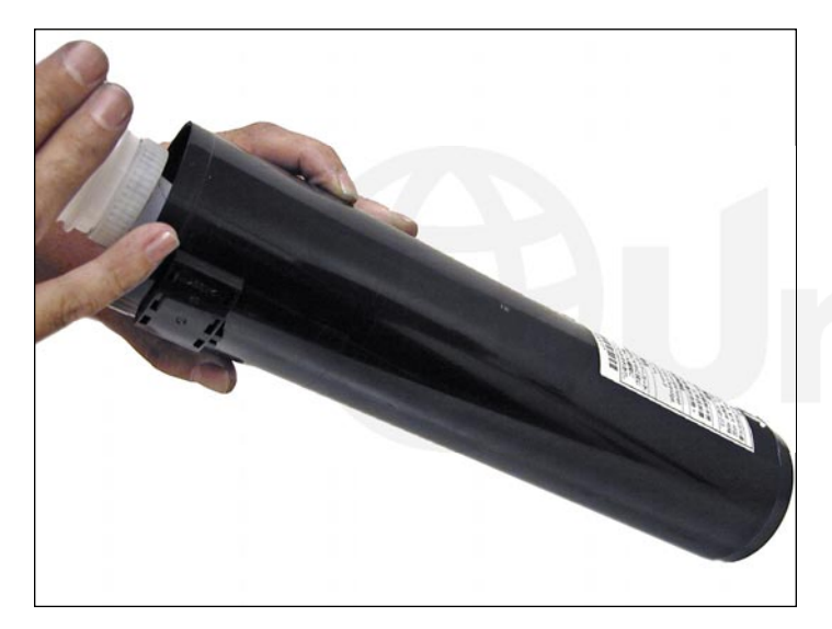
3. Vacuum the tube clean, and fill with new toner.