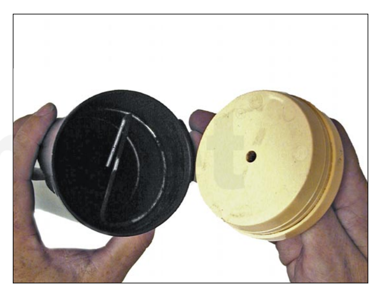
2. Remove the end cap.