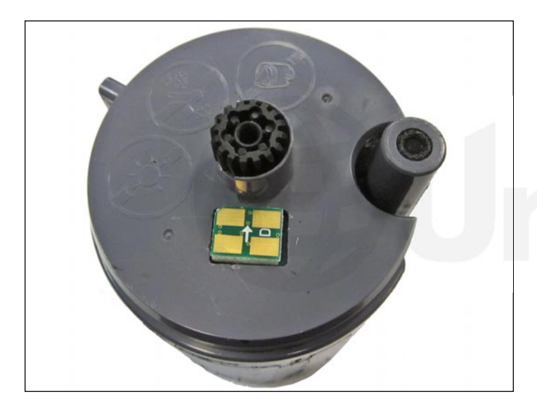
6. Peel off the strip to expose the adhesive on the reverse side of the new hardware replacement chip. Install the new chip in the small space shown. Remanufacturing complete.

You will on the other hand, need to remove the OEM contact by using a small flat head screw driver and prying them off.