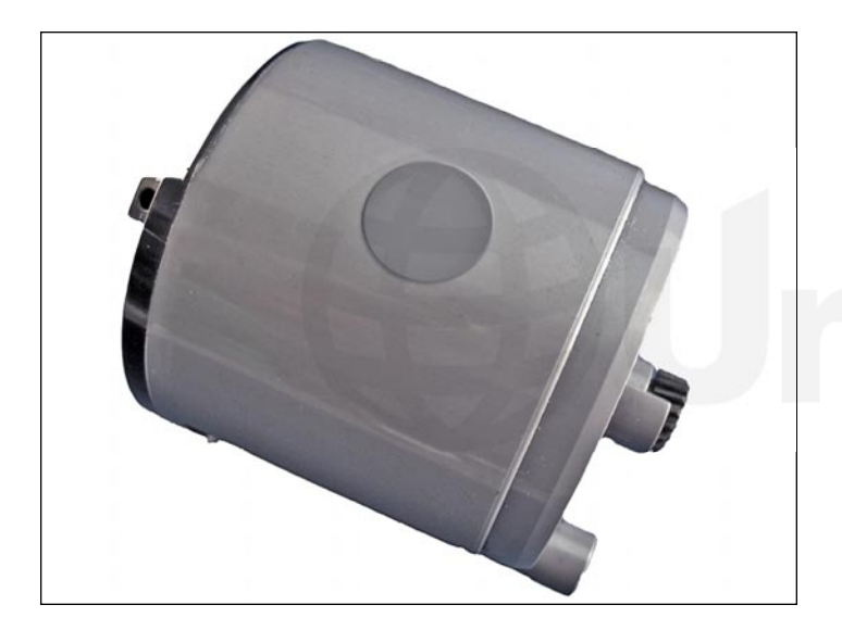
4. Cover the hole using a small piece of tape. Make sure the seal is tight and that there are no leaks. Also make sure the tape/label does not extend to the top of the cartridge as it is installed. This area has a very tight fit and the seal may be torn off as the cartridge is installed.