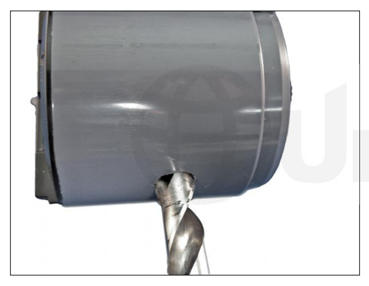
2. The hole can be drilled with a 1/2" drill bit or melted with a soldering iron. If it is drilled, great care must be taken to get all the shavings out. If it is melted, the outer edge of the hole has to be shaved flat with a razor blade. Clean out all the remaining toner/shavings thoroughly.