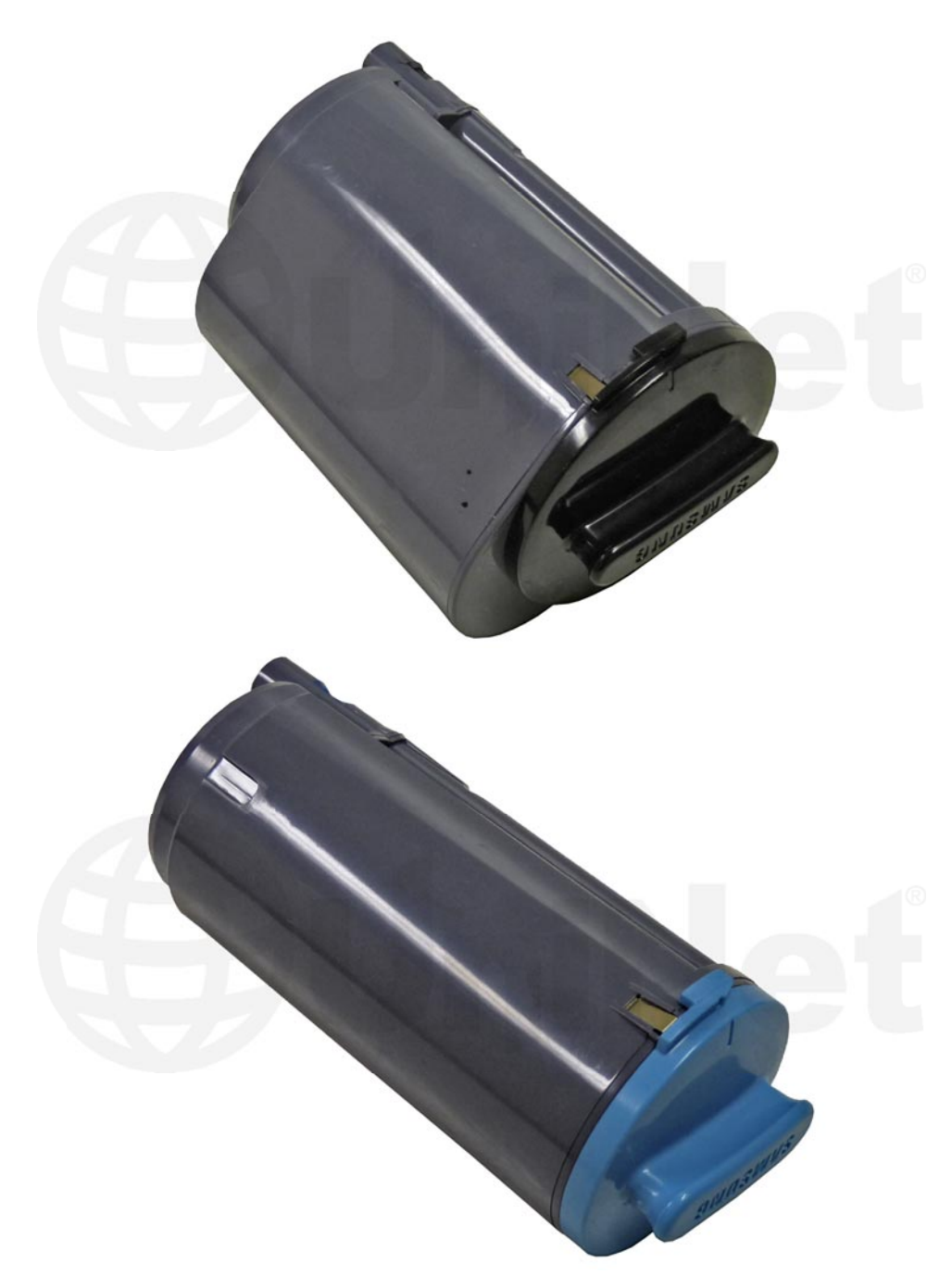
SAMSUNG CLP-350 SERIES TONER CARTRIDGE