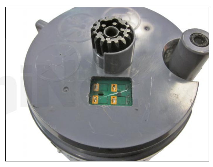
REPLACING THE CHIP