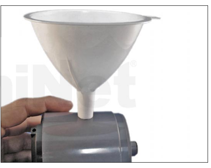
3. Insert a small funnel into the hole and fill with new toner for use in CLP-350.