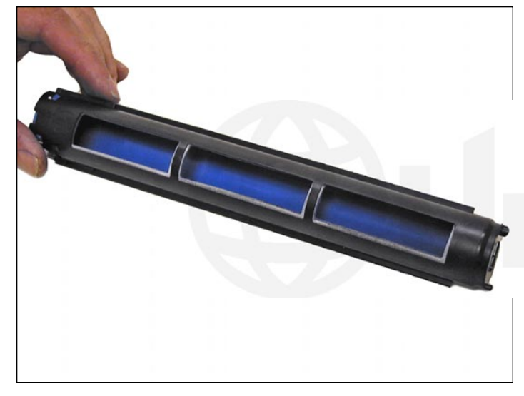
1. Turn the blue handle so that the toner port is open.

The Okidata B2200 toner cartridges are used in the B2200 and B2400 machines. They are rated for 2,000 pages at 5% coverage. There is a chip on the cartridge that must be replaced each cycle. The OEM cartridge part number is 4364030.