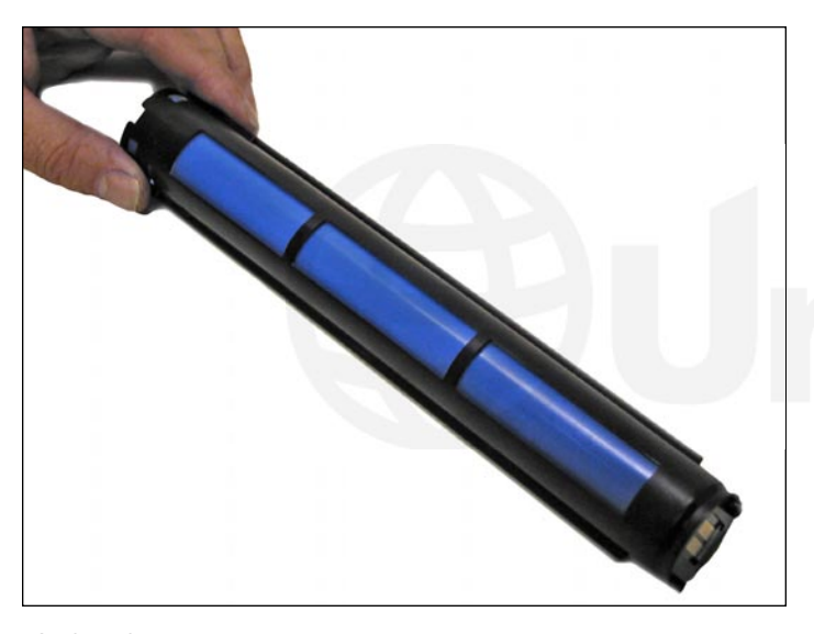
3. Carefully turn the blue handle so the toner port is closed.